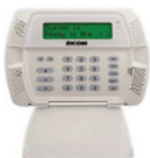
Wireless Main Panel